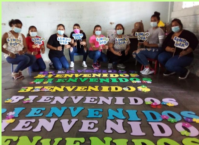
See 'Education' on page 3

SBSC funded two projects in the Bajo Lempa region of El Salvador earlier this year that provide educational benefits to Salvadoran students. One of the projects funded infrastructure improvement to the kindergarten through grade 9 school on the Isla de Montecristo. The other project was a three-day skills-building course for the 29 educators who staff the five pre-school education centers in the Bajo Lempa. The projects accomplished the expressed goals of a more functional and comfortable school facility in Montecristo as well as a more skilled and effective teaching staff at the pre-school education centers, respectively. But they did more as well!